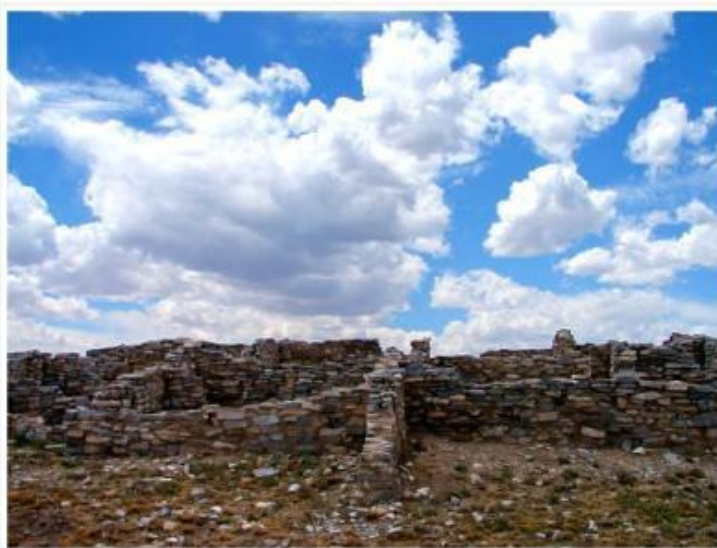
SALINAS PUEBLO MISSIONS GRAN QUIVIRA NEW MEXICO

The earliest known Protestant church was founded by the Dutch in their colony of New Netherland (now New York) in 1514; they established the Dutch Reformed Church as the colony's official religion.