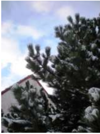
In Jicin, Czech Republic