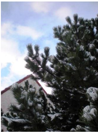
In Jicin, Czech Republic

We have all figured out by now, I hope, that choosing a career is not simple, not clean and clear, and not really predictable. Most likely, the best use for the right brain, left brain theory (or the “party” theory, or the “introvert/extrovert” theory, for that matter) is as a metaphor, a non-literal way to think about something abstract and complex.