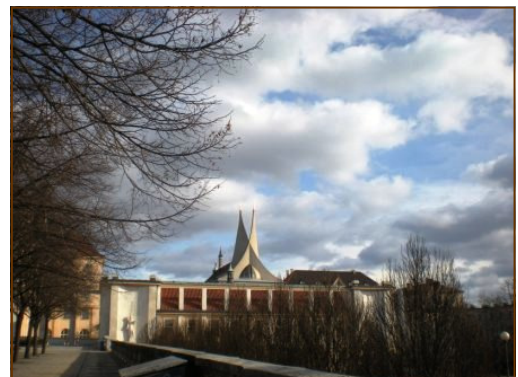
Prague: Emauz Church in springtime

A liberal arts education, which is broad and multi-faceted, gives you transferable skills by helping you see connections between disciplines, by demanding that you develop decent writing and communication skills, and by making you aware of the scope of human history, scientific achievements and culture.