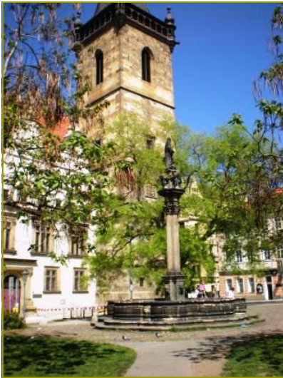
New Town Hall at Karlovo namesti

When the New Town of Prague was built 700 years ago, it was meant to serve as Prague's main commercial district. And that is how it can still be characterized today. Numerous businesses, hotels and banks are located there, as well as department stores, boutiques and a few small shopping malls. The New Town is also rich with culture, offering many theatres, movie theatres, museums, and an opera house.