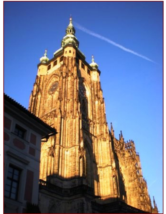
St Vitus Cathedral at Hradcany