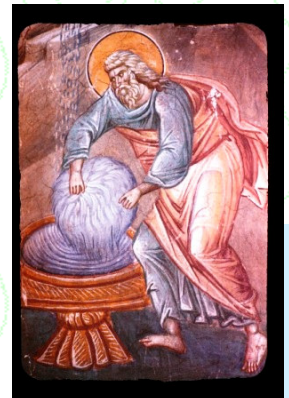
Gideon lays his fleece—from a fresco in a Serbian monastery